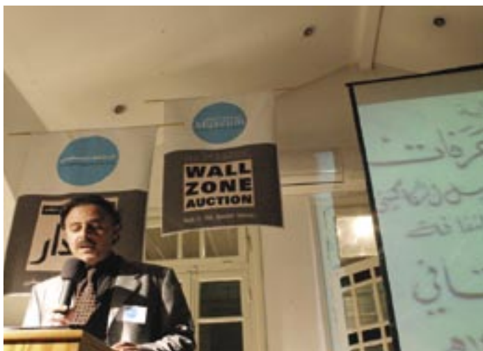
The 3rd Annual Wall Zone Auction, 2004

He is currently living and working between London, New York and Ramallah.