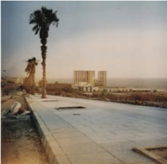
Beirut Bereft Cote d'Azur Hotel, 2007, 2007 C-print

Born in Lebanon in 1978. He lives and works between Saida (Lebanon) and Paris. He is represented by Almine Rech Gallery, Paris/Brussels.