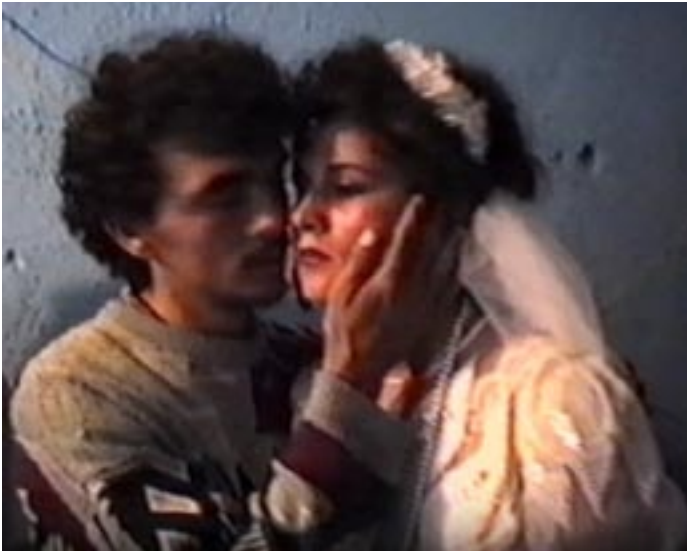
Last Gestures , 2009