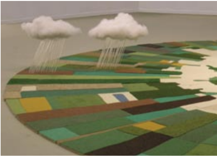
Nabalal (Partly Cloudy) , 2011 MDF, carpets, acrylan, plexiglas