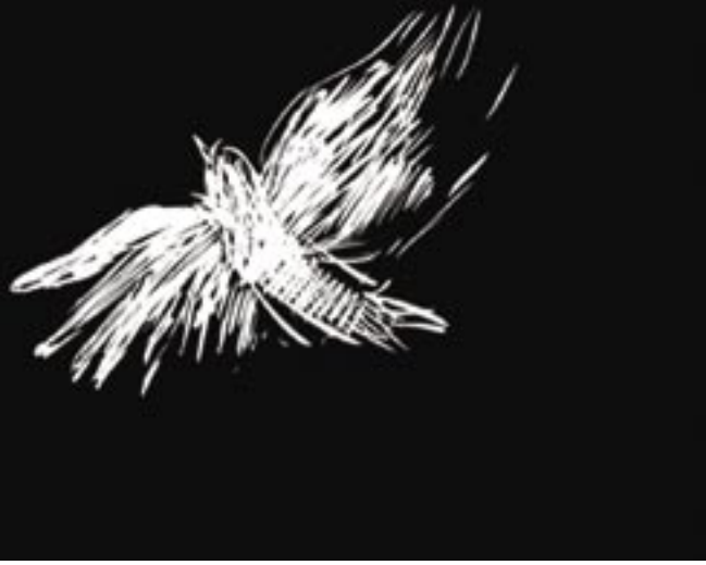
No darkness will make us forget , 2011 Short movie, 8'

Born in 1970 in Istanbul, where he lives and works.