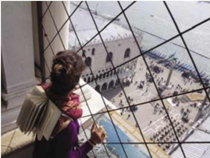
The Angels of Venice, 2011 Photos

He is represented by Fumagalli Gallery, Bergamo and Christian Stein Gallery, Milan