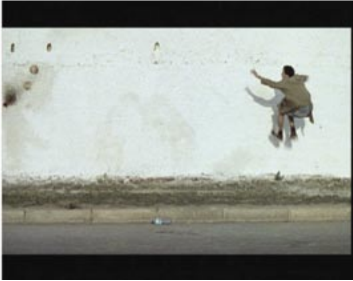
Le Mur , 2000 Short film, 10'

Born in 1967 in Morocco, where he lives and works.