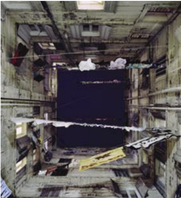
Cour intérieure, 17 février 2009