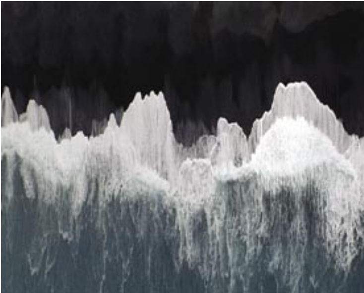
La Mer, 2001 Video, 27'32''