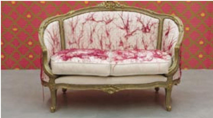
Le Salon Courbé, 2007

She is represented by Minini Gallery, Milan, Cheim and Read Gallery, NYC, and Kukje Gallery in South Korea.