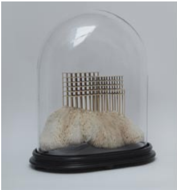
L'illogica abitudine, 2011 Coral, resin, glass

Born in 1973 in Italy, he lives and works between Milan and Geneva. He is represented by Analix Forever Gallery, Geneva.